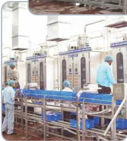
▲ Liquid Milk Packing