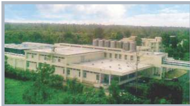
▲ Liquid Milk Packing Plant

IF UNDELIVERED PLEASE RETURN TO: UMANG DAIRIES LIMITED GULAB BHAWAN, 3RD FLOOR, 6A, BAHADUR SHAH ZAFAR MARG, NEW DELHI - 110 002.