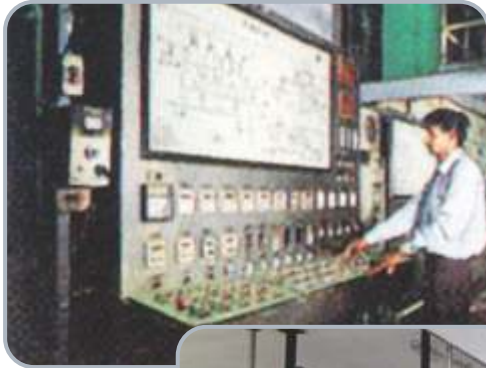
▼ Control Panel of Processing Plant