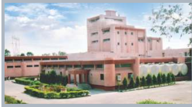
▲ Drying Plant